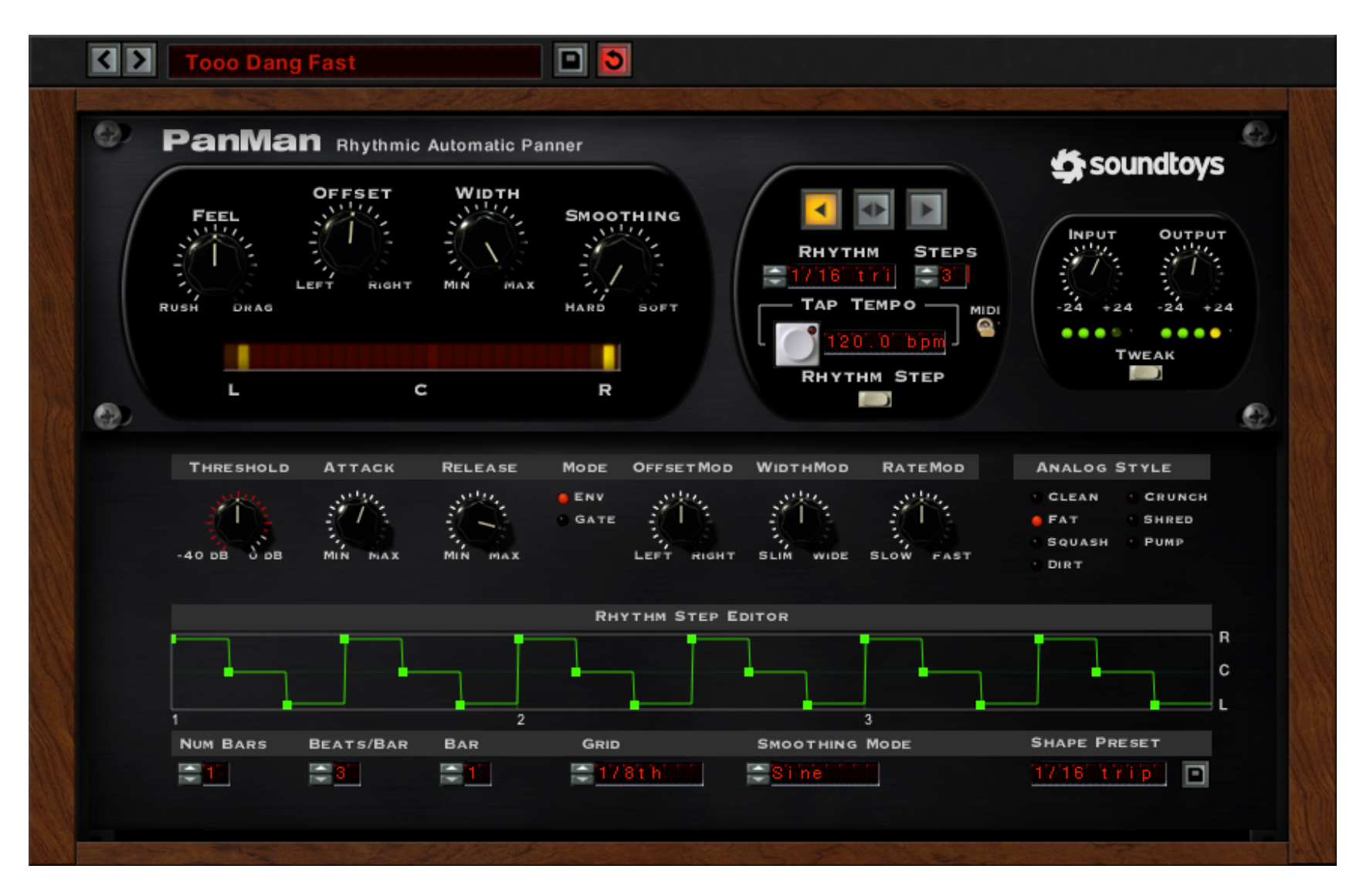
Figure 1: PanMan's Control Panel and Tweak Menu - Rhythm Step Mode