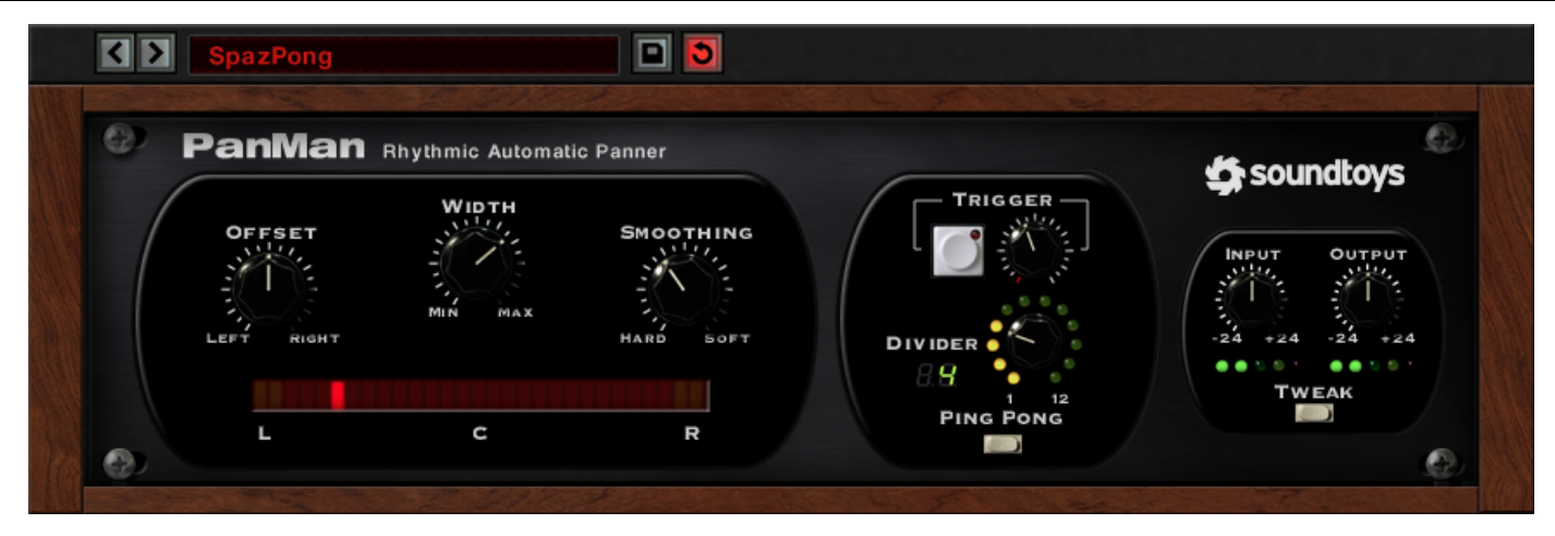
Figure 13 : Control Layout in Ping Pong Mode