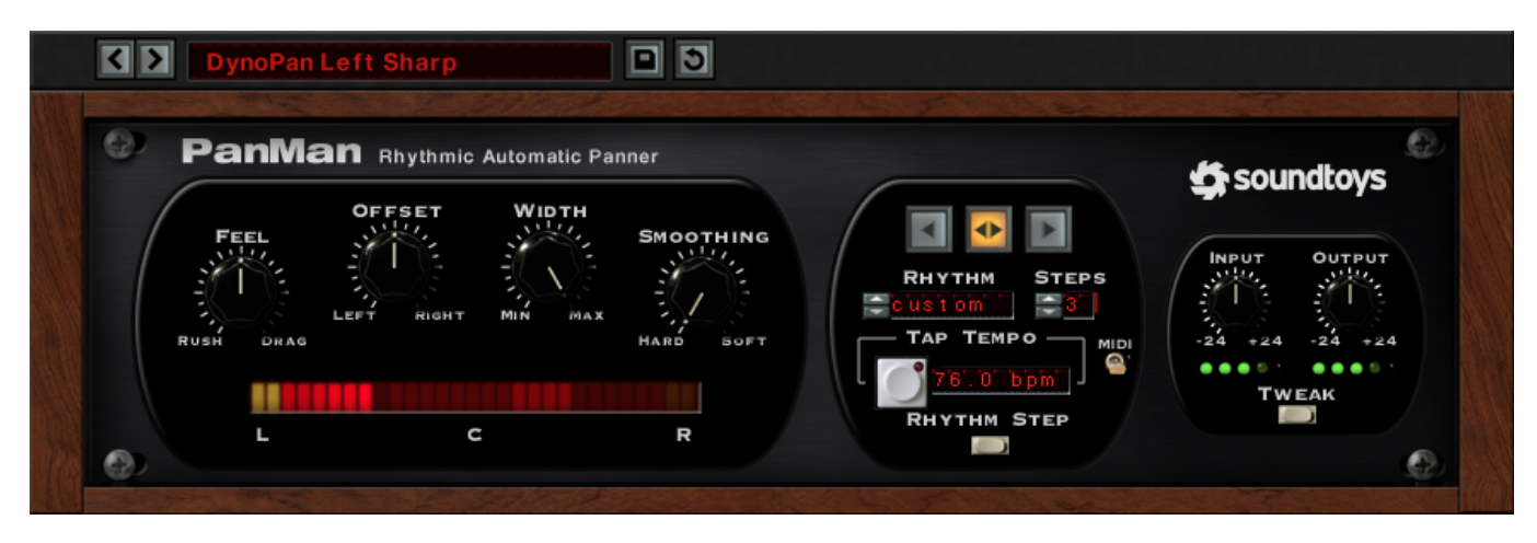
Figure 9: Main Control Layout in Rhythm Step Mode