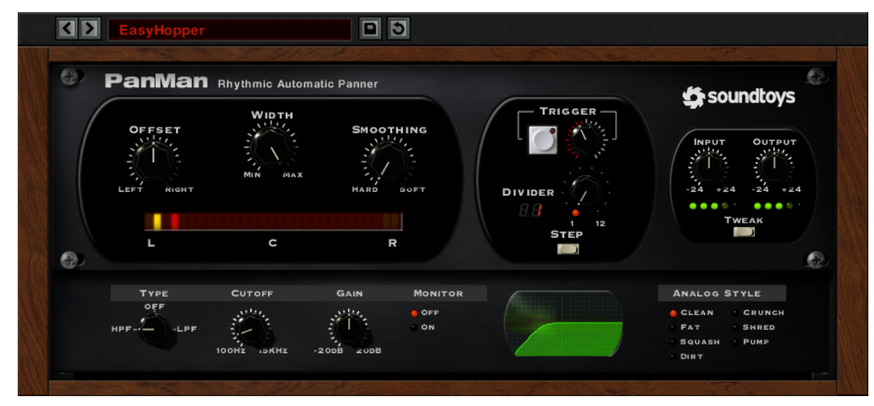
Figure 17: Step Mode's Control Panel and Tweak Menu