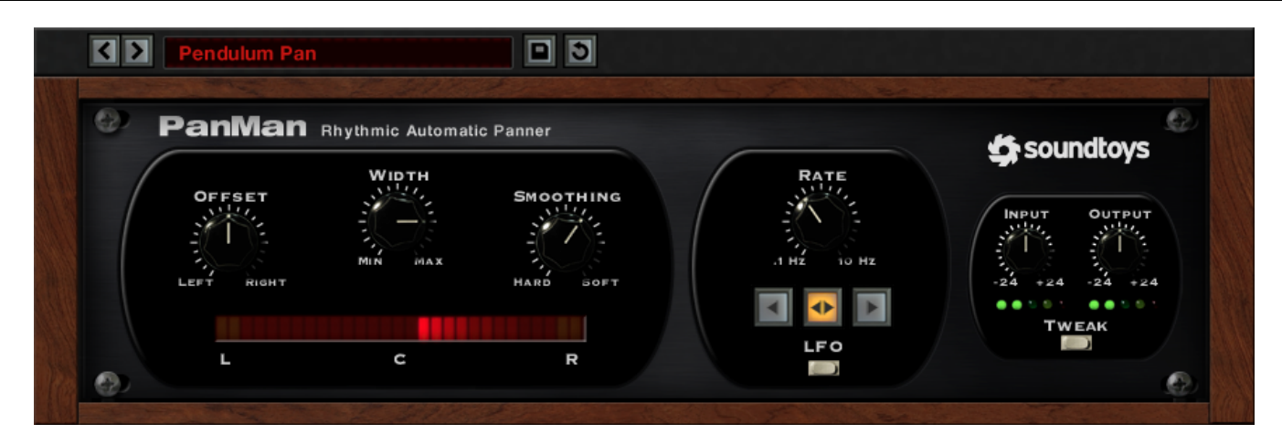
Figure 2: The PanMan Control Panel - LFO Mode