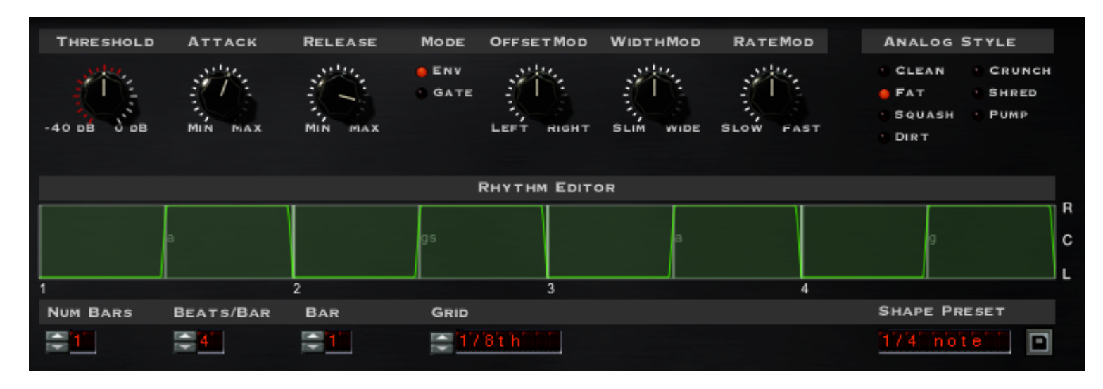
Figure 12: Rhythm Shape Mode's Tweak Menu