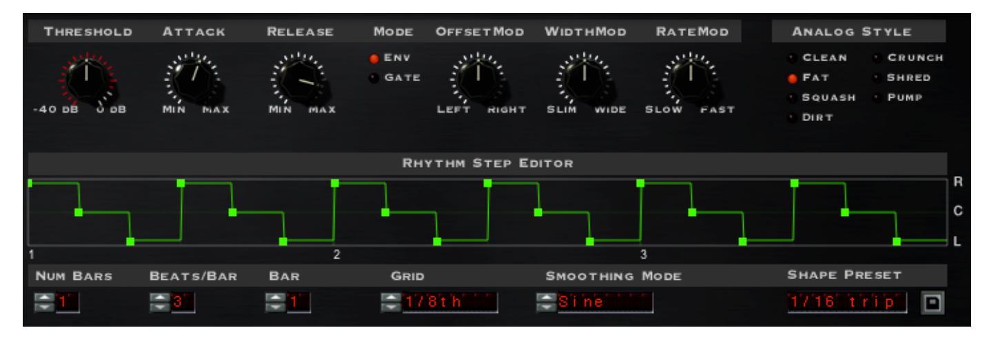
Figure 10: Rhythm Step Mode's Tweak Menu