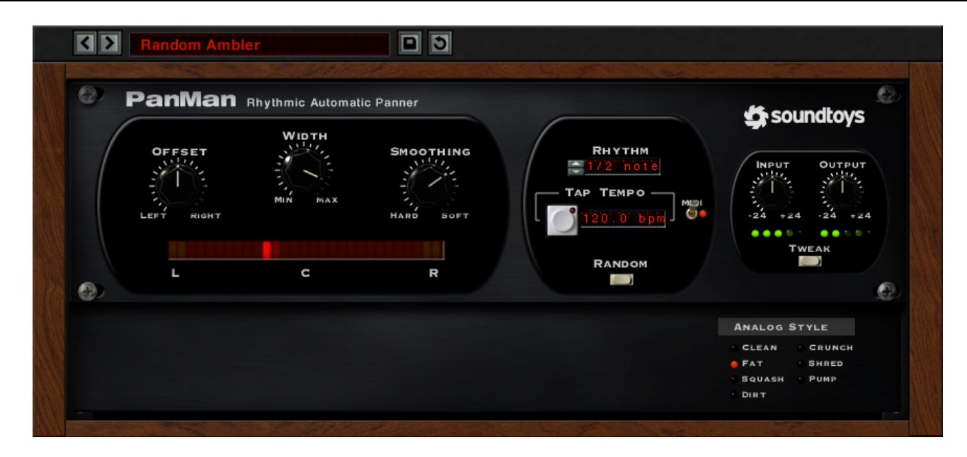
Figure 16: Random Mode's Control Panel and Tweak Menu