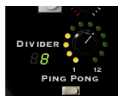
Figure 14: Trigger Divider - Halfway There!

To turn off audio based triggering (if you're using MIDI or manual triggering), set the threshold of the Trigger knob all the way up.