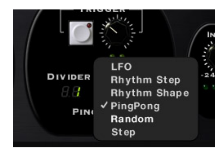
Figure 6: After changing Modulation Modes