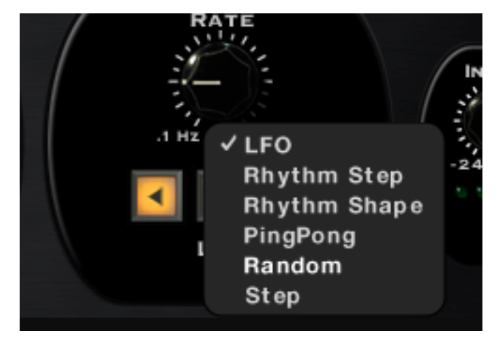
Figure 5: The Modulation Menu

The currently selected modulation mode will appear as text above a beige push-button. To change modulation sources, click and hold on the push button below the currently displayed mode. This will bring up a small selectable menu listing the modulation modes. Select the desired mode with your cursor and release the click. You will notice that the name above the button will change as will the control layout of PanMan. Though the button name will change to reflect the selected type of modulation, the function of this button remains constant.