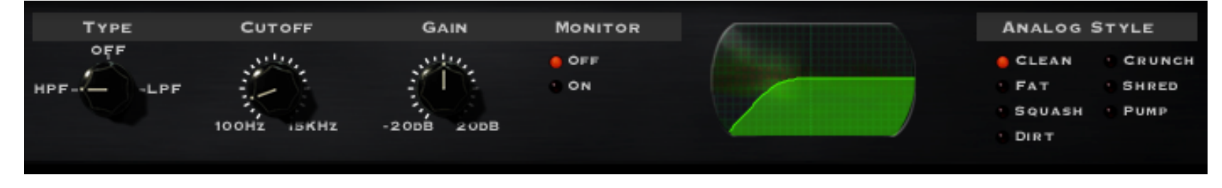
Figure 15: Control Layout in Ping Pong Mode