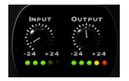
Figure 3: Output LED indicating maximum signal level

These controls are particularly useful with the different Analog Style algorithms (found in the Tweak Menus for each mode), allowing you to adjust the amount of saturation and distortion present in PanMan.