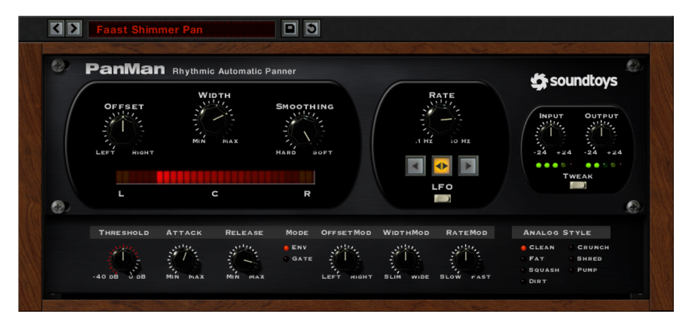
Figure 7: LFO Mode Control Panel and Tweak Menu