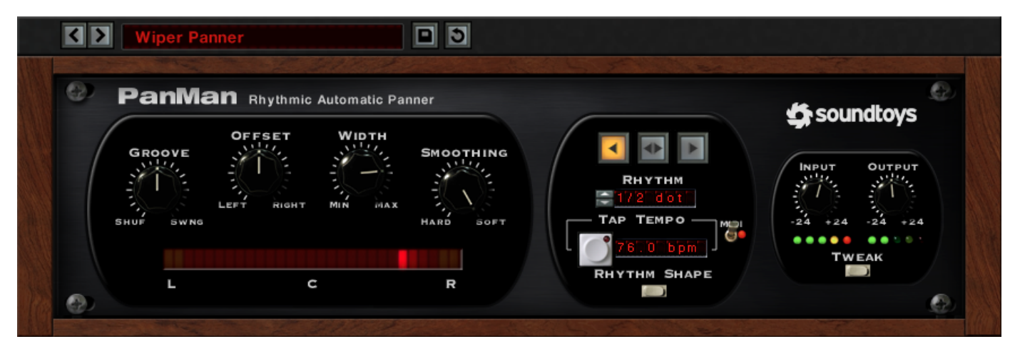
Figure 11: Main Control Layout in Rhythm Shape Mode