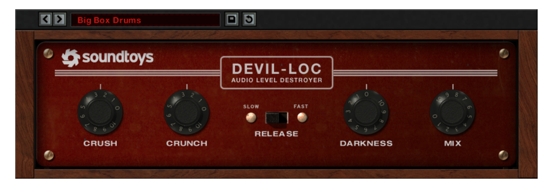
Figure 1: The Devil-Loc Deluxe GUI