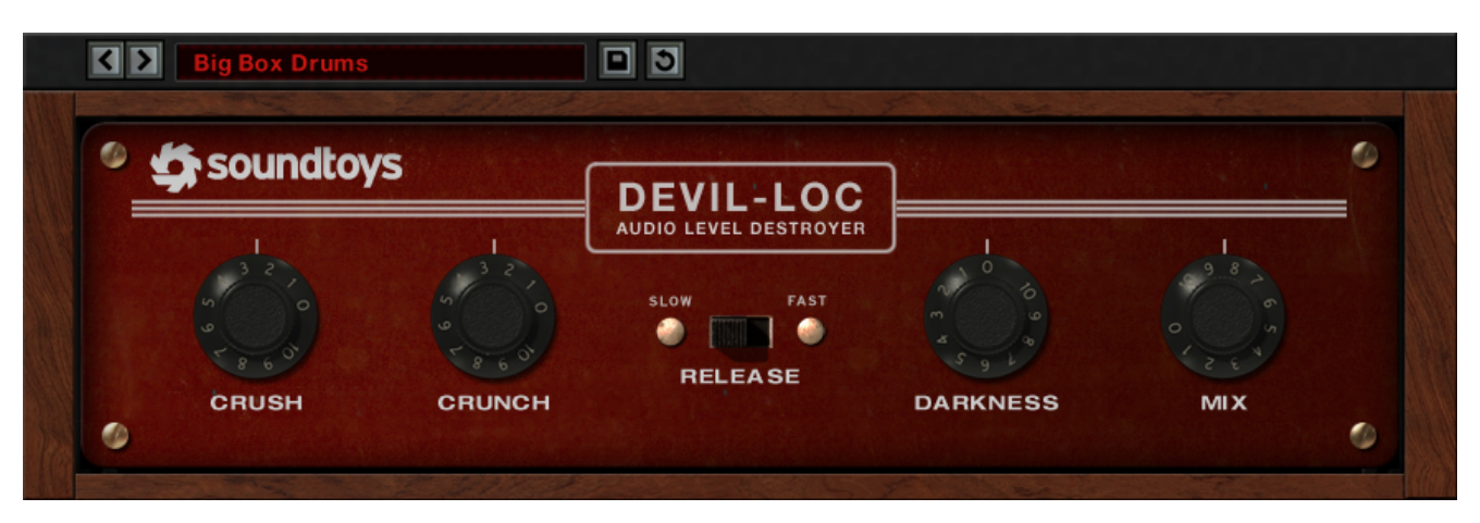
Figure 2: The Devil-Loc Control Panel